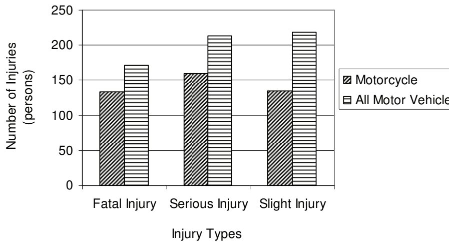
Figure 3 Road injuries and motorcycle injuries