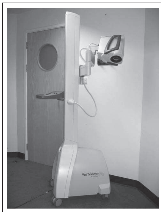
Fig. 1. Mobile vein imaging system.

Fifty questionnaires were completed between June 1, 2009, and March 31, 2010: 11 by consultants, 16 by registrars, 20 by senior house officers, and 3 by nurses. They had been taught how to use the Vein Viewer by a colleague (n = 37) or by reading the instruction manual (n = 13). A calibration was carried out once every morning, which lasted <5 min. After that, it took about 1 min to switch on the device. No additional patient preparation was necessary. Of the 50 patients, 38 had blood drawn for diagnostic purposes, and 12 had a cannula inserted for intravenous treatment. The mean age of the