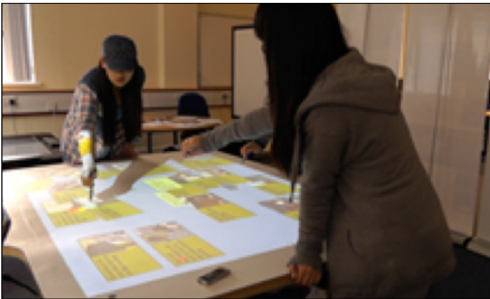
Figure 2. Group C: sorting

It was evident in more than one instance that the ability to enlarge the slips prompted reading aloud, encouraged discussions around its content, and pulled students together in the task. All the information visible on the table provided a space of learning (Walsh, 2011) to scan information, search for links between them, reflect on their thinking and make necessary changes (Figure 3). This facility made a high-cognitive-demand activity manageable (Cummins, 2008) with regard to both thinking and speaking in a foreign language.