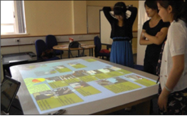
Figure 3. Group B: Checking final layout of reasoning

In addition, labelling groups of slips and sequencing generated a lot of talk of clarifications, differentiation of causes, reasons or effects, and evaluation or re-examination of their decisions. This resulted in a move to higher-order thinking. There was evidence of sequences consisting of proposals, acceptance, checking, and dispute to further the discussion (Jewell, 1996). As the thinking skills advanced, so did the organisation of the talk. Long and complex stretches of turn-taking reflected students' interactional competence mediated by the table. Many examples implied the use of discourse markers. For instance, 'maybe' was used to seek confirmation or make comments during proposals. 'This' and 'that' were used as a way to signal joint attention to slips. The striking number of occurrences of 'this' in all three groups leads to the conclusion that it is used as an economic device in terms of working memory to spare more space for a speedy and fluent discussion of reasons as shown in Extract 1.