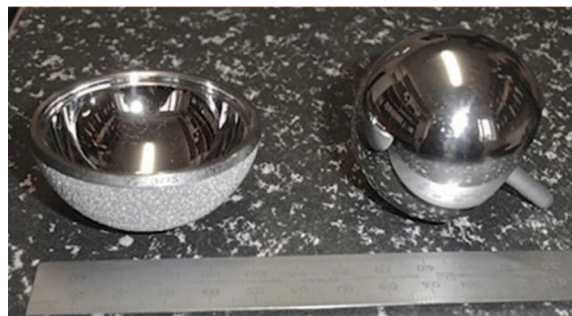
Figure 1 DePuy ASR™ resurfacing hip (note the small femoral stem right). To the left is the acetabular cup and to the right is the single-piece femoral component.

Whilst total hip replacement has had considerable positive outcomes for patients, in some cases medical implants have caused unexpected results detrimental to their desired effect. Such adverse events raised awareness of inadequacies not only of device development and testing, but also of device governance (Freemantle 2011; Riordan et al. 1998; Sedrakyan 2012). In addition, it has been argued that new and innovative designs of hip and knee implants show no benefits over older designs (Nieuwenhuijse et al. 2014). Implants require particular care as they act in vivo and can have considerable impact on the surrounding tissue and wider metabolism. In considering shortfalls in the testing, use and governance of MoM hip implants we are reminded of similar issues which have arisen over the past two decades (cf. Anderson et al. 2007; Faulkner 2009) including: the 3M™ Capital™ hip (Muirhead-Allwood 1998; The Royal College of Surgeons of England 2001) and the Sulzer Hip system failures (Stephens et al. 2006). Despite these significant events the modes of governance of medical implants – professional, notifying and regulatory – were again shown to be lacking by the recent global