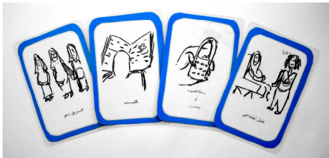
Figure 1. Pictorial set of trump cards used to discuss with the women how they would prefer to communicate with healthcare providers and to access health information

Two ideation artifacts, or probes, were designed to actively engage the women participants in discussions and to support their imagination of ideas as to how technology might be used to provide ANC services. Mindful of the low literacy levels of this refugee population, the artifacts were pictorial in character with minimal writing. The first probe was a set of trump cards (Figure 1) used to identify how they would prefer to: (1) be contacted by healthcare providers; (2) contact healthcare providers; and (3) access health information. Options included booklets, phone calls, text messages, peers, and social workers.