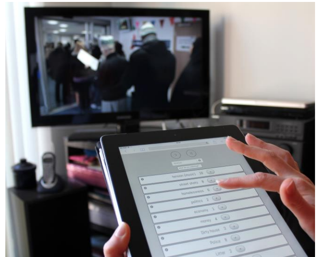
Figure 1. Mock-up of SG being used as a second-screen

to complete a “homework” exercise. These involved using SG whilst watching television. Participant experiences and the outcomes of their ‘spotting’ activities would then be discussed in the following workshop. Overall this formed three workshops, and two homework activities per group.