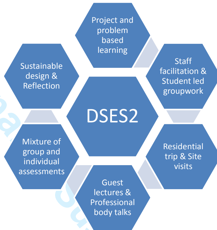
Figure 3.1: DSES 2 Teaching and Assessment Model.