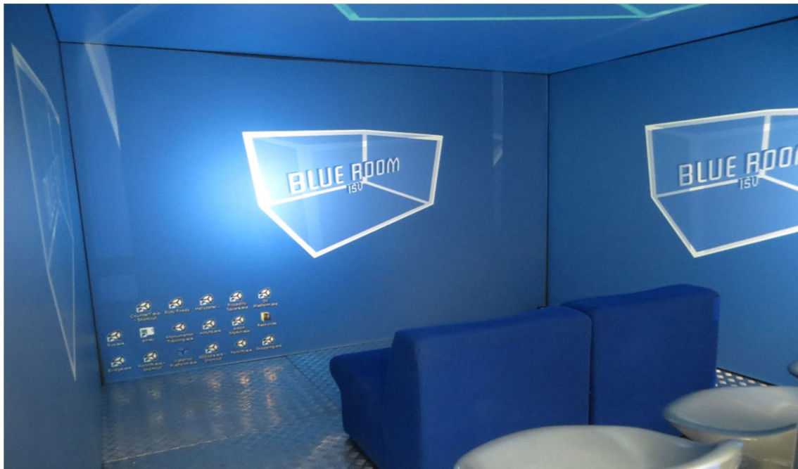
Fig. 1 Picture of the Blue Room virtual reality environment

following link shows a session in progress: https://www.youtube.com/watch?v=9U-rRC8jc28 .