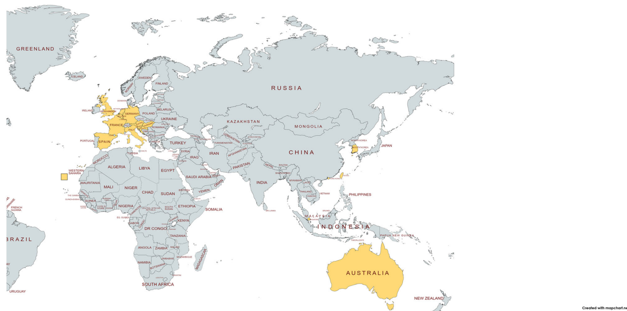
Figure 1 Countries currently participating in the ARTORIA-R.

The registry aims to achieve detailed information regarding the underlying congenital heart defect and the previous treatment of the patient. With this information, different cohorts [systemic left ventricle, systemic right ventricle, single ventricle (either anatomic left or right ventricle)] can be interrogated. Data will be collected about